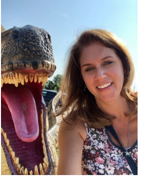
The Pita Pit Raptor

⇒ One of my favorite restaurants in our area is Pita Pit where they have a photogenic Velociraptor (get it, a wrap-tor) outside.